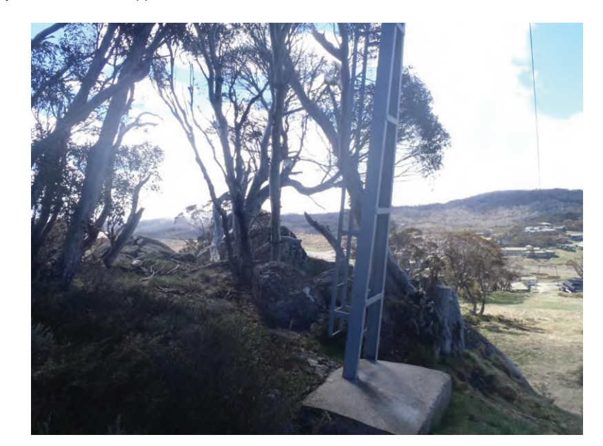
Figure 7: Trees and rocks to be removed/reduced in height [Group 1]