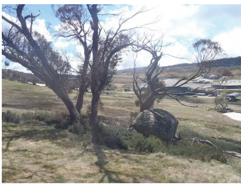
Figure 20: Tree and rock removal (lower end of Group 4)