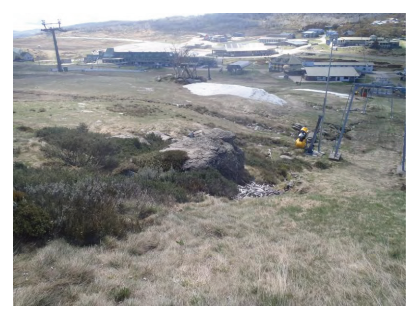
Figure 21: Rock removal (Group 5)