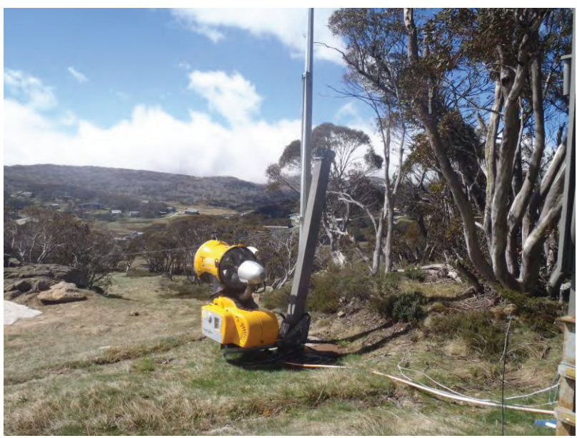
Figure 5: Existing light pole and fan gun to be removed and re-located (F1)