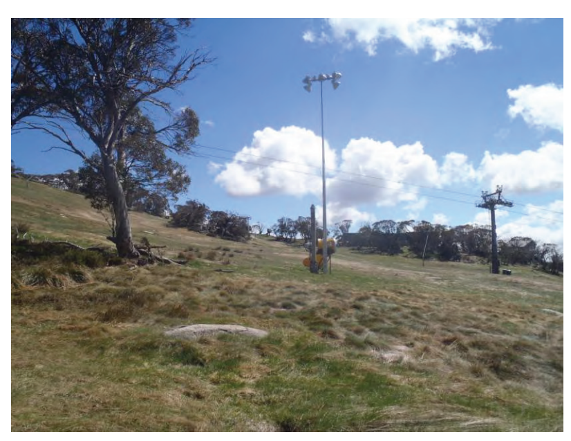
Figure 18: Existing light pole and fan gun to be removed and re-located (F3)