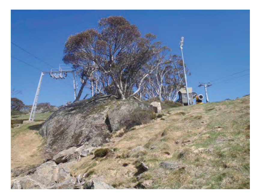
Figure 10: Tree and rock removal/reduction in height (lower end of Group 1)