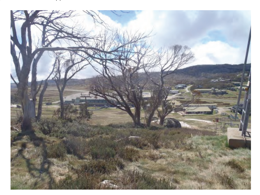
Figure 19: Tree and rock removal [lower end of Group 4]