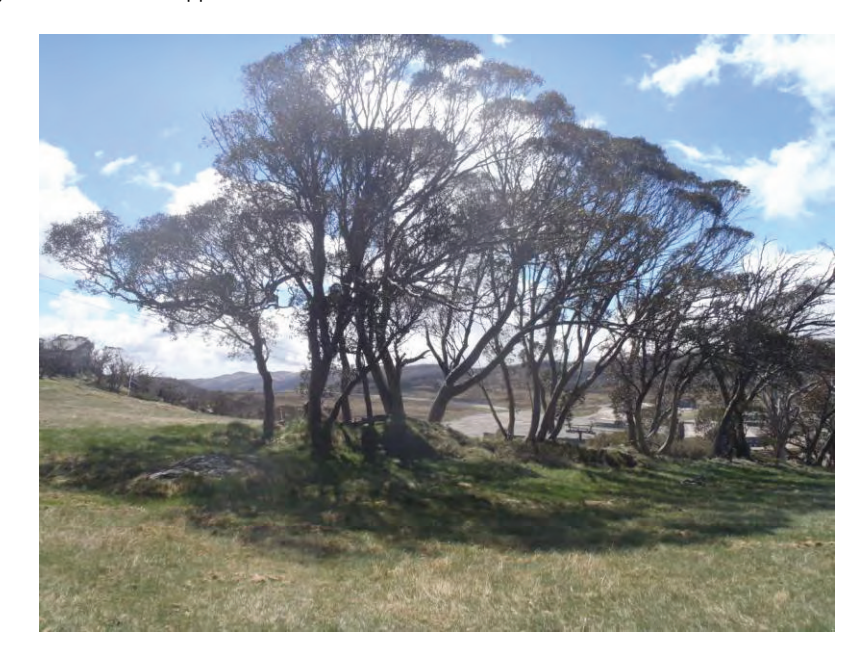
Figure 13: Tree and one rock removal (Group 4)