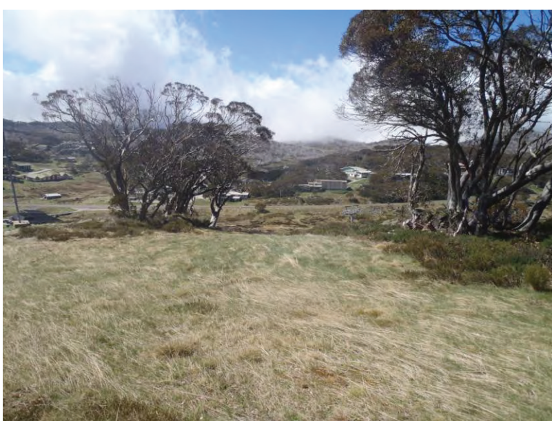
Figure 14: Offset tree and heath planting area