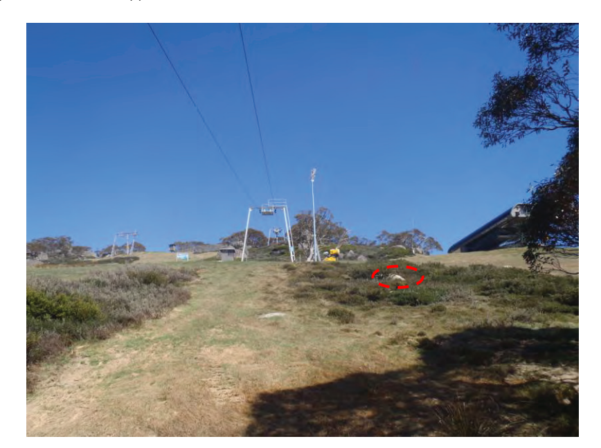
Figure 1: New hut location on top of rock with entrance feature to be located adjacent to exiting fan gun and light pole