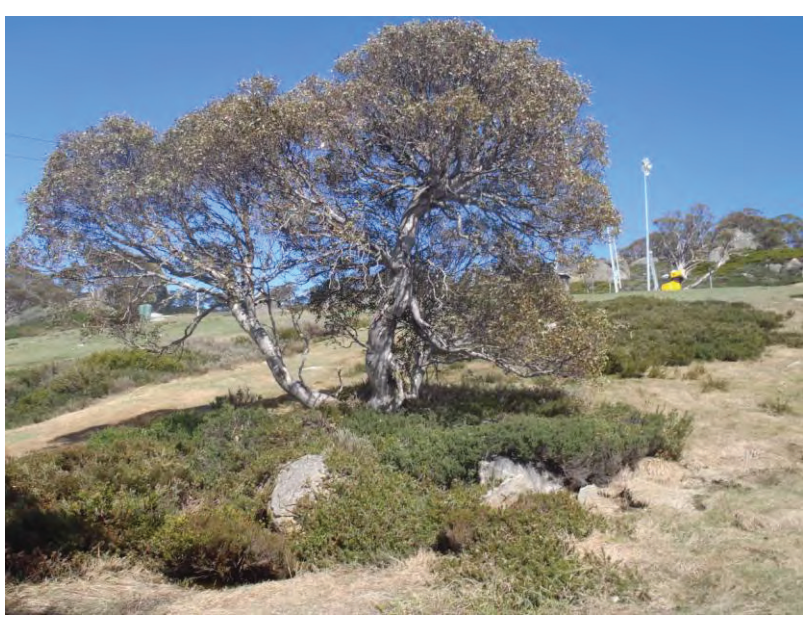
Figure 2: Tree to be removed as part of Group 1