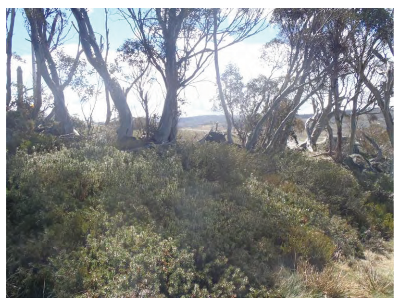
Figure 8: New location for relocated Fan Gun and Light Pole (F1)