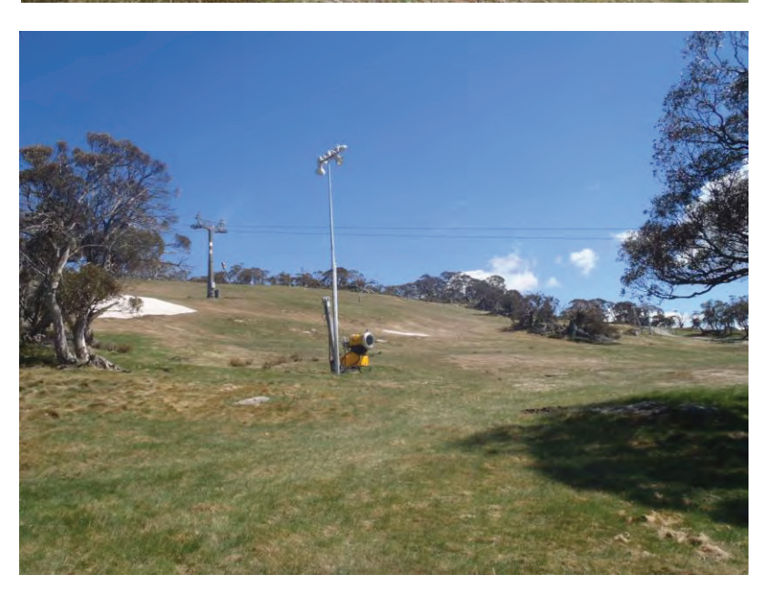
Figure 15: Existing light pole and fan gun to be removed and re-located (F2)