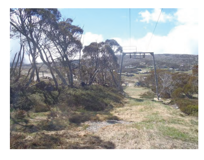
Figure 6: Sturt Tbar with the trees on the left to be removed (Group 1)