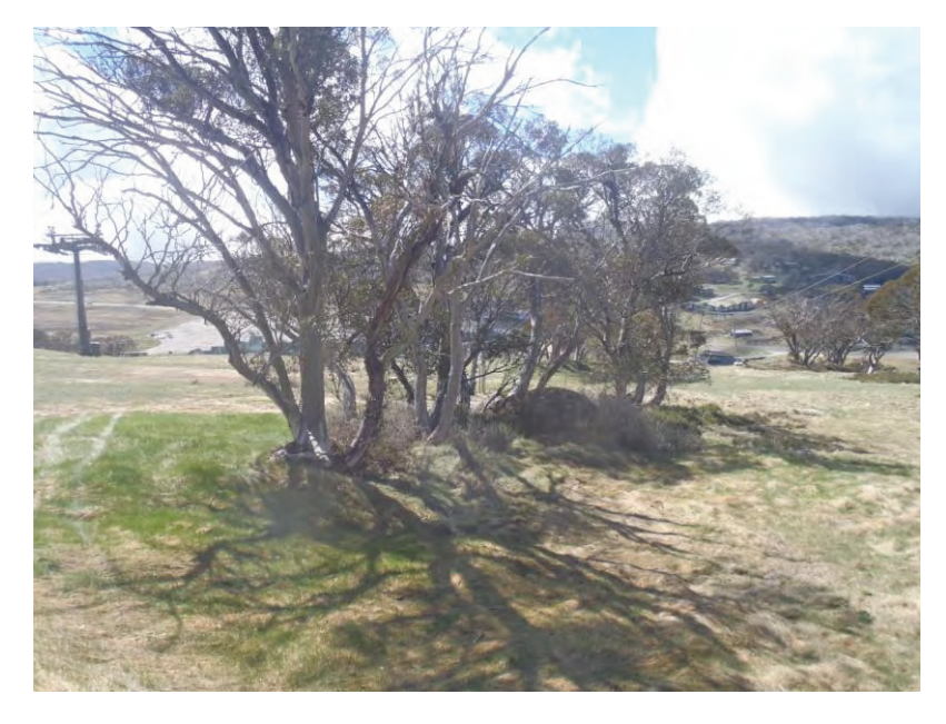
Figure 12: Tree removal with one rock to be removed (Group 3)