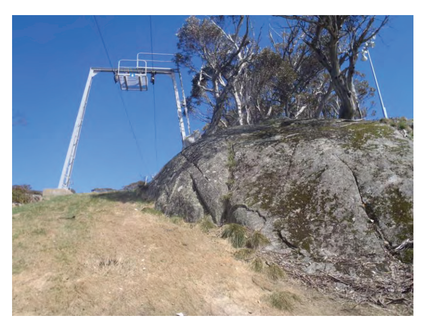
Figure 9: Part rock removal, due to being located within T-bar track (Group 1)