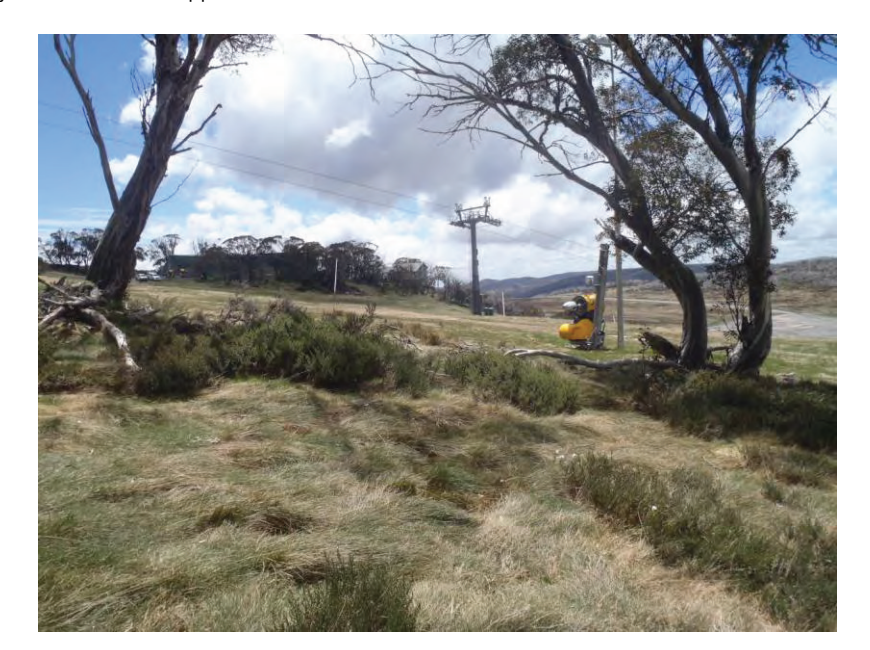
Figure 16: New location for existing light pole and fan gun (F2)