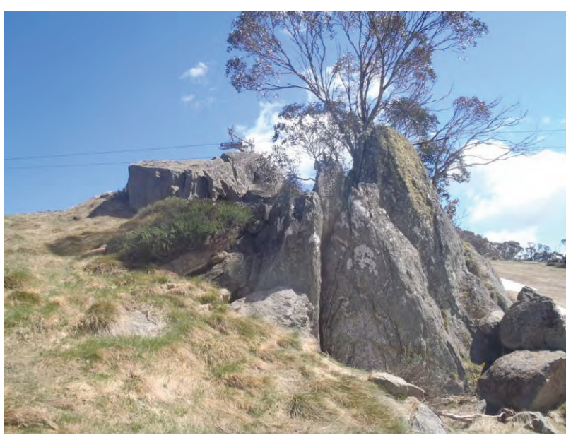
Figure 11: Tree and rock removal/reduction in height (Group 2) with limited heath removal