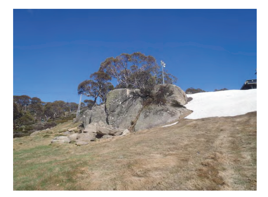
Figure 4: Rock outcrop to be mostly removed/reduced in height (Group 1)