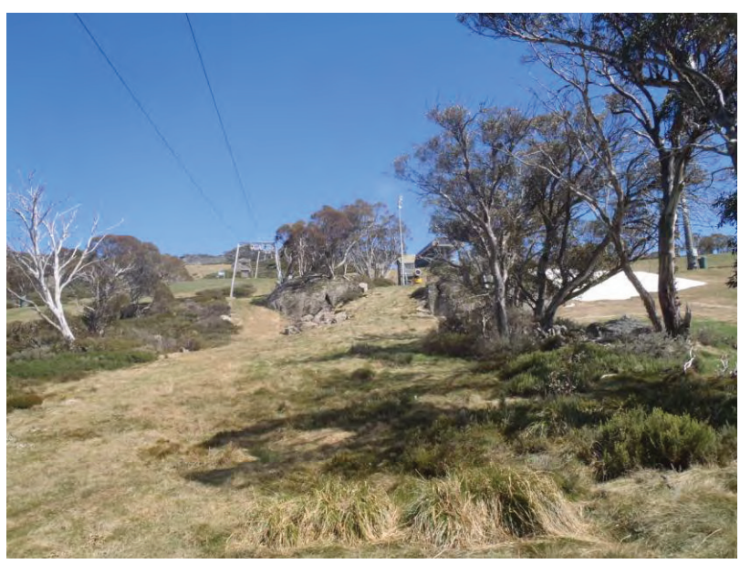
Figure 17: Tree and rock removal (Group 4)